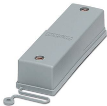
Protective cover, Range of articles: VARIOCON, design: VC4, housing material: PA 6, color: gray

Please be informed that the data shown in this PDF document is generated from our online catalog. Please find the complete data in the user documentation. Our general terms of use for downloads are valid.