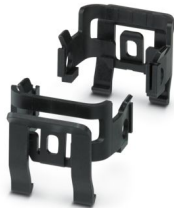
Connection element, design: B6 - B24

Please be informed that the data shown in this PDF document is generated from our online catalog. Please find the complete data in the user documentation. Our general terms of use for downloads are valid.