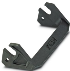
Single locking latch for B24 housing, HC-EVO....AL and HC-STA....AL

Please be informed that the data shown in this PDF document is generated from our online catalog. Please find the complete data in the user documentation. Our general terms of use for downloads are valid.