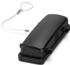
Protective cover B24, for double locking latch, protective cover material: PC, height: 26.3 mm, seal: no

Please be informed that the data shown in this PDF document is generated from our online catalog. Please find the complete data in the user documentation. Our general terms of use for downloads are valid.