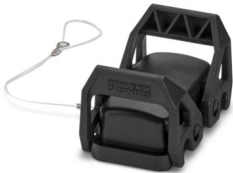
Protective cover B10, with double locking latch, protective cover material: PC, height: 26.3 mm, seal: yes

Please be informed that the data shown in this PDF document is generated from our online catalog. Please find the complete data in the user documentation. Our general terms of use for downloads are valid.