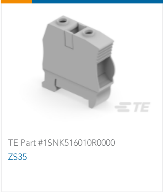
TE Part #1SNK516010R0000 ZS35