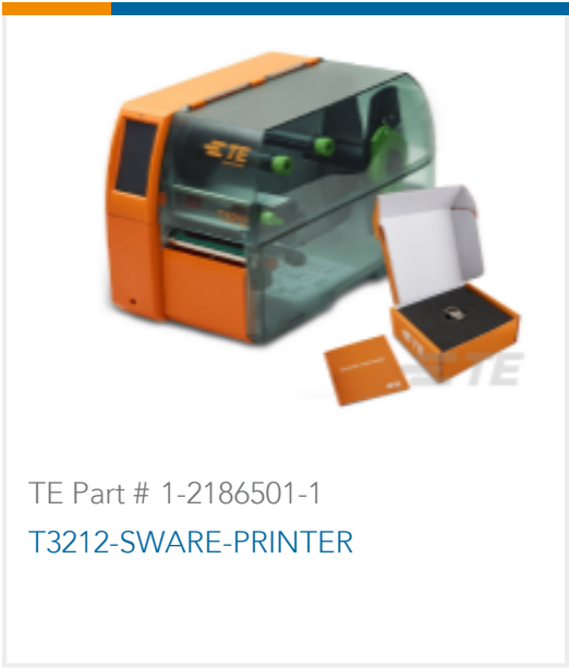
TE Part # 1-2186501-1 T3212-SWARE-PRINTER