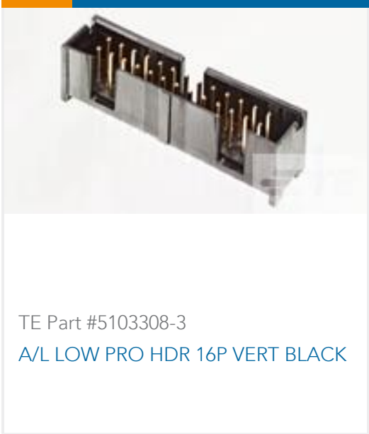
TE Part #5103308-3 A/L LOW PRO HDR 16P VERT BLACK