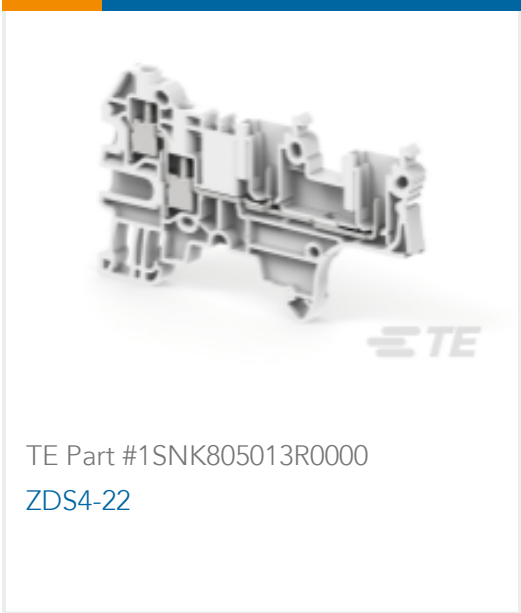
TE Part #1SNK805013R0000 ZDS4-22