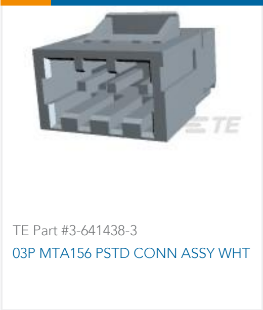
TE Part #3-641438-3 03P MTA156 PSTD CONN ASSY WHT