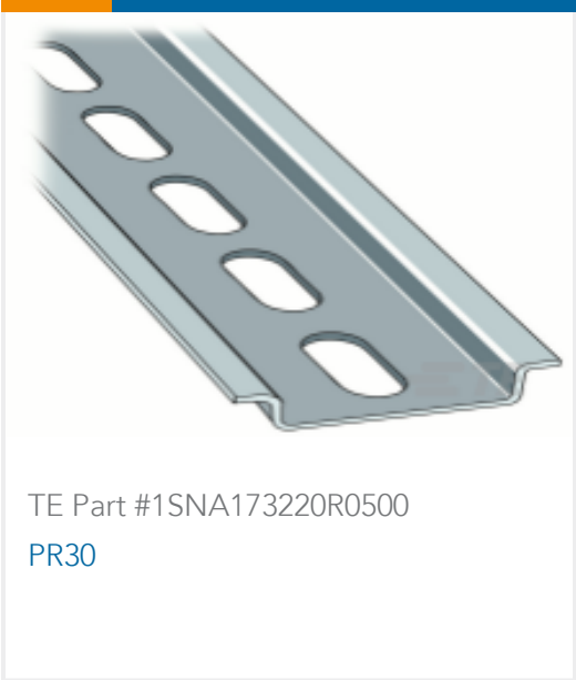
TE Part #1SNA173220R0500 PR30