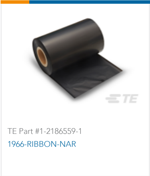
TE Part #1-2186559-1 1966-RIBBON-NAR