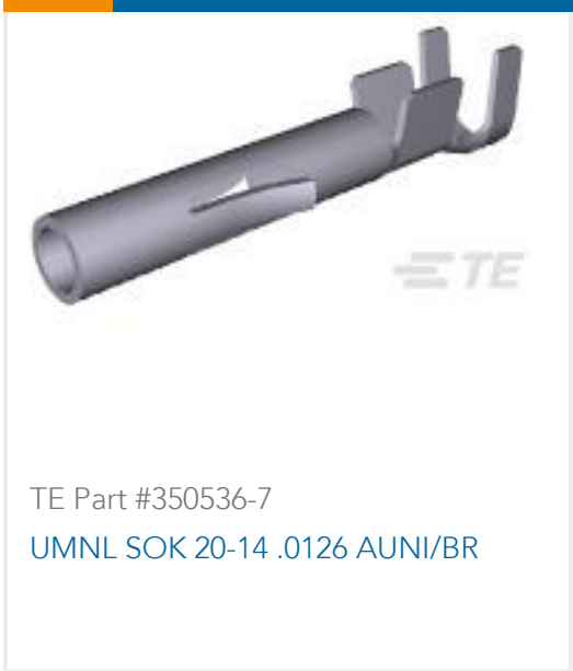
TE Part #350536-7 UMNL SOK 20-14 .0126 AUNI/BR