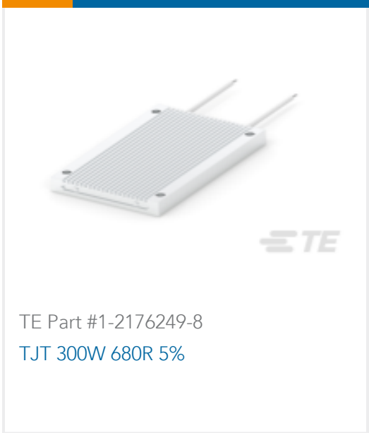
TE Part #1-2176249-8 TJT 300W 680R 5%