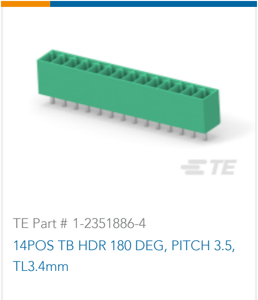
TE Part # 1-2351886-4 14POS TB HDR 180 DEG, PITCH 3.5, TL3.4mm

5POS TB HDR 180 DEG, PITCH 3.5, TL 3.4mm