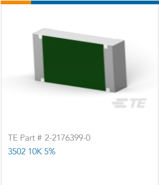
TE Part # 2-2176399-0 3502 10K 5%