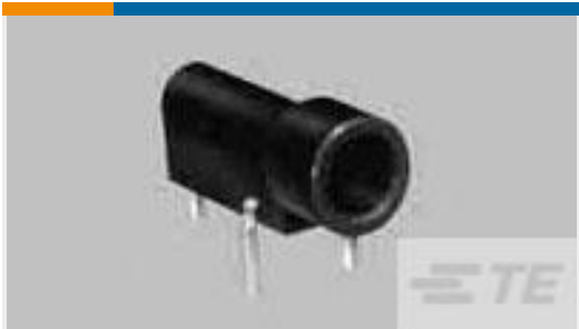
TE Part # 350180 TEST PROBE ASSEMBLY, REC, PA66, BLACK