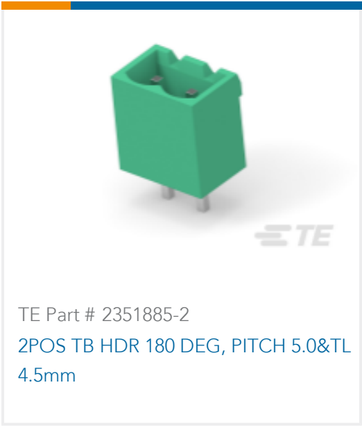
TE Part # 2351885-2 2POS TB HDR 180 DEG, PITCH 5.0&TL 4.5mm