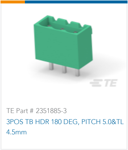
TE Part # 2351885-3 3POS TB HDR 180 DEG, PITCH 5.0&TL 4.5mm