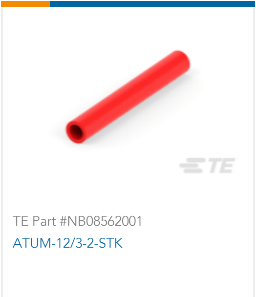
TE Part #NB08562001 ATUM-12/3-2-STK

8POS TB HDR 90 DEG, PITCH 3.5 & TL 3.5mm