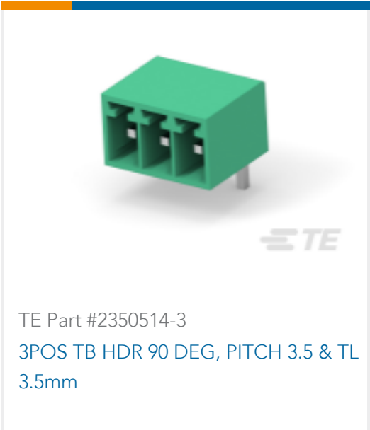
TE Part #2350514-3 3POS TB HDR 90 DEG, PITCH 3.5 & TL 3.5mm