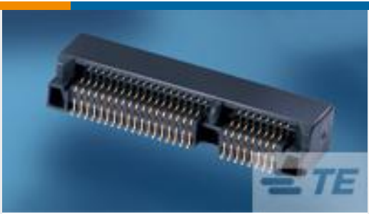
TE Part #2041119-2 mSATA/mini PCI-E 4H Type I 10u"

5POS TB HDR 90 DEG, PITCH 5.0 & TL 4.5mm