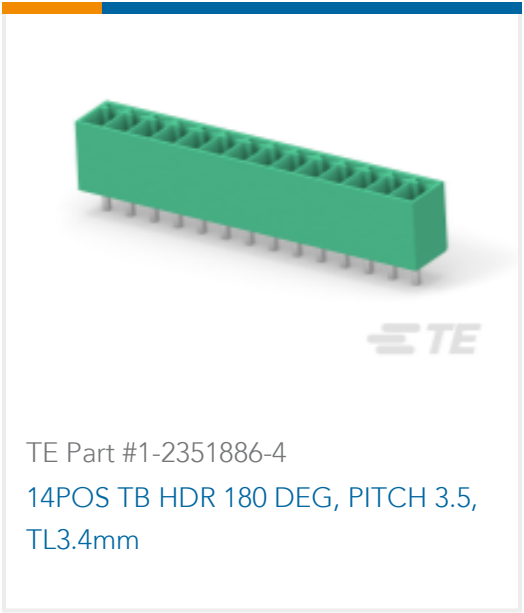
TE Part #1-2351886-4 14POS TB HDR 180 DEG, PITCH 3.5, TL3.4mm