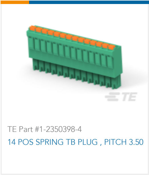
TE Part #1-2350398-4 14 POS SPRING TB PLUG , PITCH 3.50