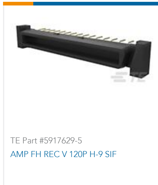
TE Part #5917629-5 AMP FH REC V 120P H-9 SIF