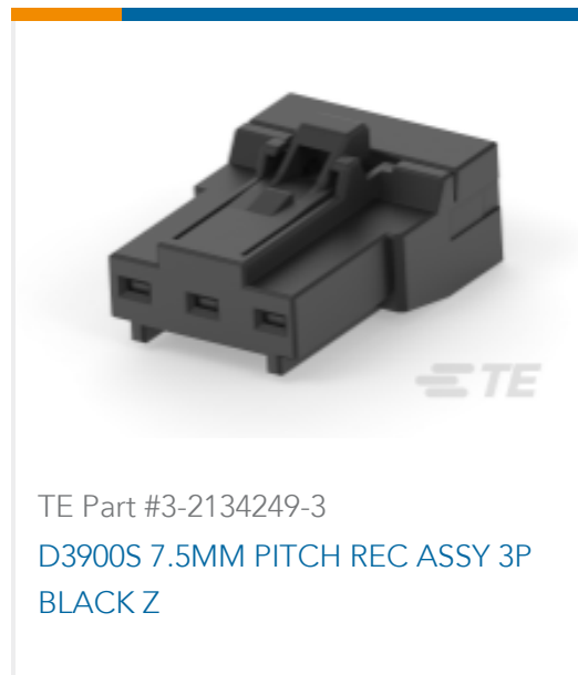
TE Part #3-2134249-3 D3900S 7.5MM PITCH REC ASSY 3P BLACK Z