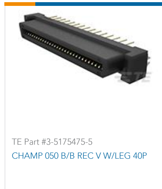
TE Part #3-5175475-5 CHAMP 050 B/B REC V W/LEG 40P