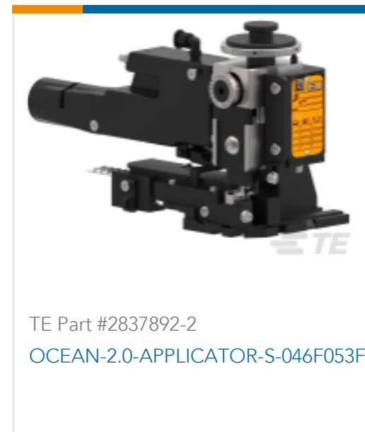
TE Part #2837892-2 OCEAN-2.0-APPLICATOR-S-046F053F