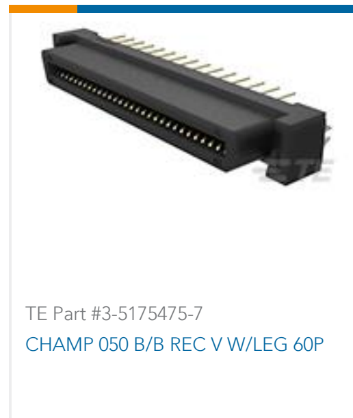
TE Part #3-5175475-7 CHAMP 050 B/B REC V W/LEG 60P