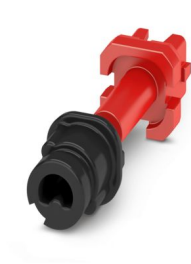
Coding profile for ICC connectors of the ICS housing series

https://www.phoenixcontact.com/us/products/1084009