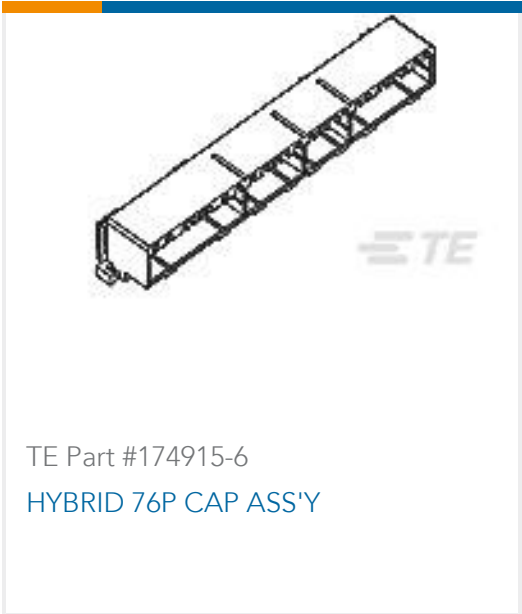
TE Part #174915-6 HYBRID 76P CAP ASS'Y