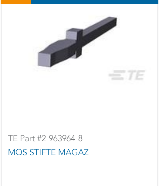
TE Part #2-963964-8 MOS STIFTE MAGAZ