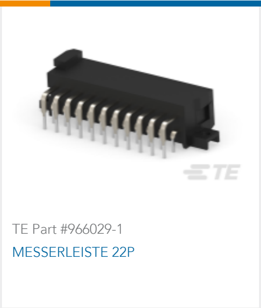
TE Part #966029-1 MESSERLEISTE 22P