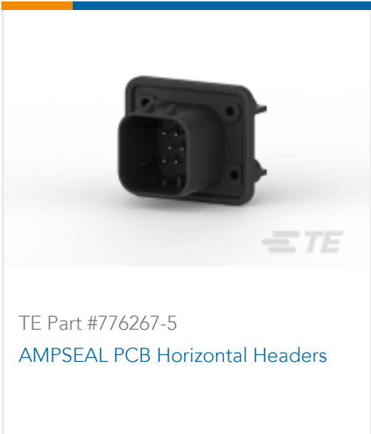
TE Part #776267-5 AMPSEAL PCB Horizontal Headers