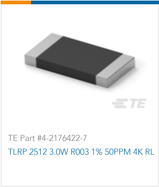
TE Part #4-2176422-7 TLRP 2512 3.0W R003 1% 50PPM 4K RL