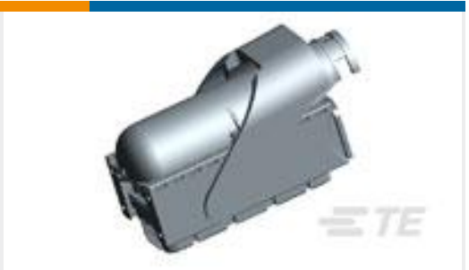
TE Part #9-1534904-4 CONNECTOR HSG 94 POS.