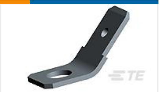
TE Part #140814-2 250 FASTON,TAB,TPBR