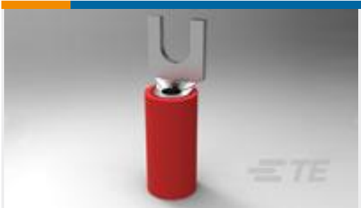
TE Part #327717 PIDG SPD 22-16 COMM 22-18MIL 4