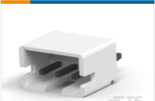
TE Part #440054-5 AMP HPI 2.0 mm Headers