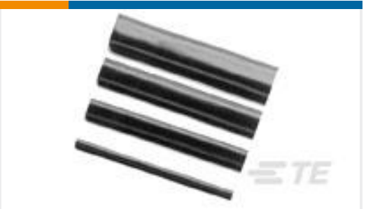
TE Part #CB5411-000 SST-6-07/FR/97