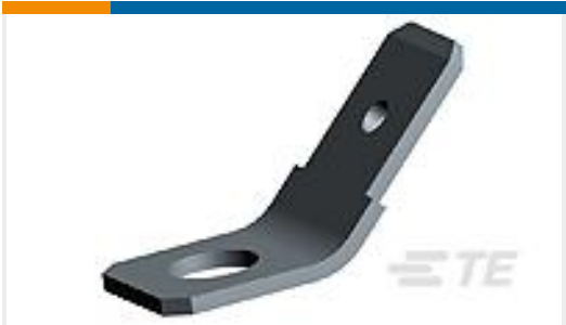
TE Part #140814-1 250 FASTON,TAB,BR