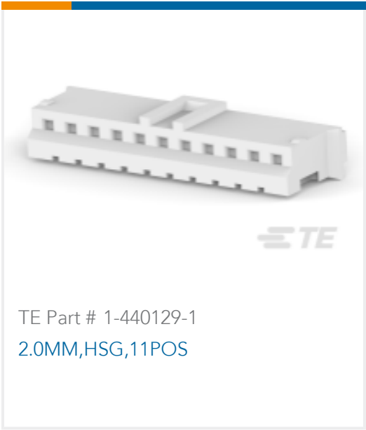
TE Part # 1-440129-1 2.0MM,HSG,11POS