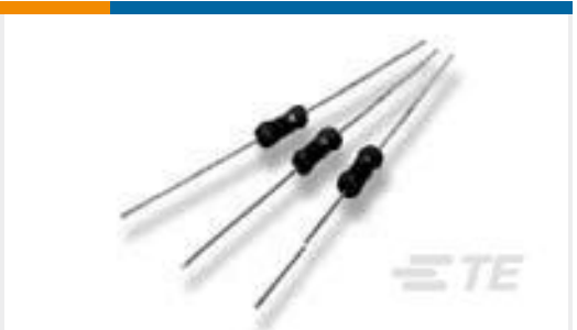
TE Part #1-1879352-5 RR02 5% 1R2 AMMO