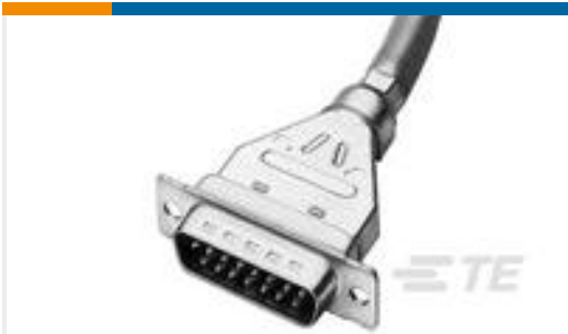
TE Part # 1658648-1 KIT,HDP-20,OVRMLD,PLUG,SIZE 3,