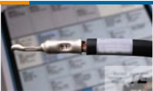
TE Part # E87503-000 SP200375WE2.5