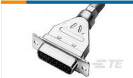
TE Part # 1658646-1 KIT,HDP-20,OVRMLD,RCPT,SIZE 1,