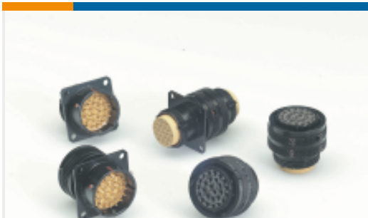
TE Part # ZPF00000000018795 FDBA 53H 10-6 PN-K