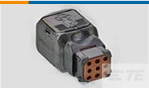
TE Part # D369-P99-NP0 369 9 WAY PLUG, NO CONTACTS, PIN