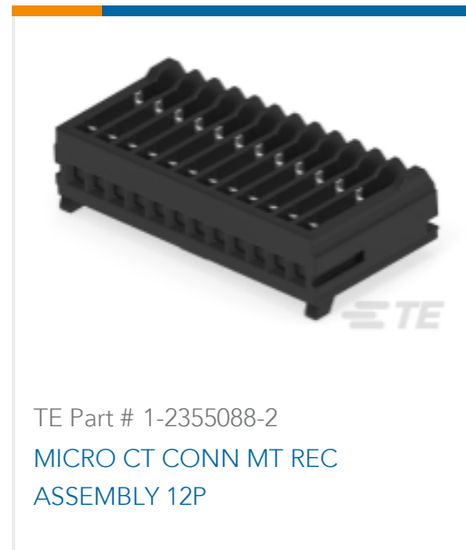
TE Part # 1-2355088-2 MICRO CT CONN MT REC ASSEMBLY 12P