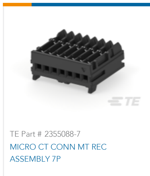
TE Part # 2355088-7 MICRO CT CONN MT REC ASSEMBLY 7P