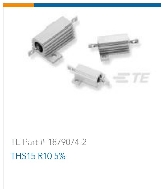
TE Part # 1879074-2 THS15 R10 5%