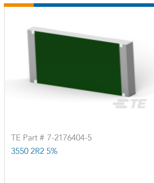
TE Part # 7-2176404-5 3550 2R2 5%