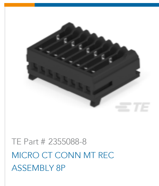
TE Part # 2355088-8 MICRO CT CONN MT REC ASSEMBLY 8P