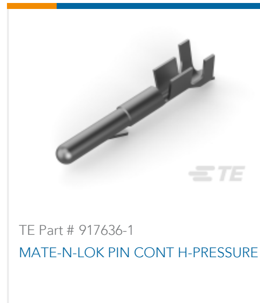
TE Part # 917636-1 MATE-N-LOK PIN CONT H-PRESSURE