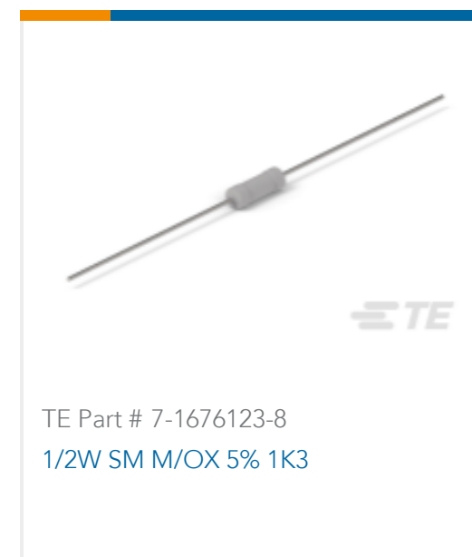
TE Part # 7-1676123-8 1/2W SM M/OX 5% 1K3