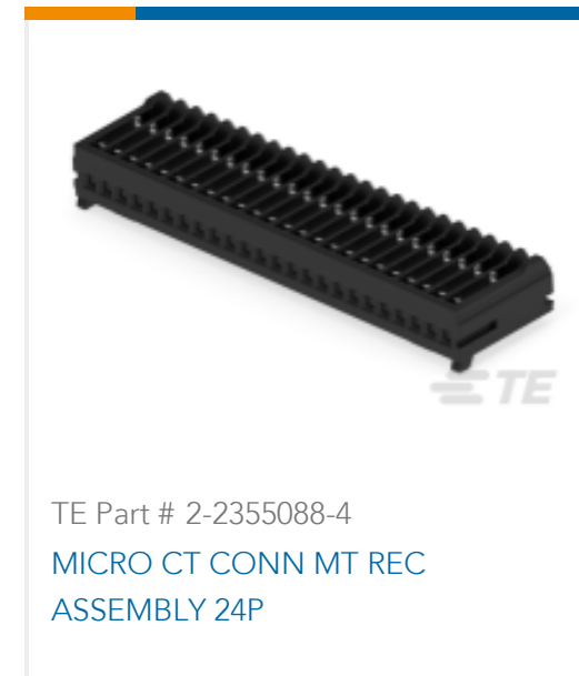
TE Part # 2-2355088-4 MICRO CT CONN MT REC ASSEMBLY 24P