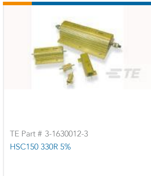
TE Part # 3-1630012-3 HSC150 330R 5%