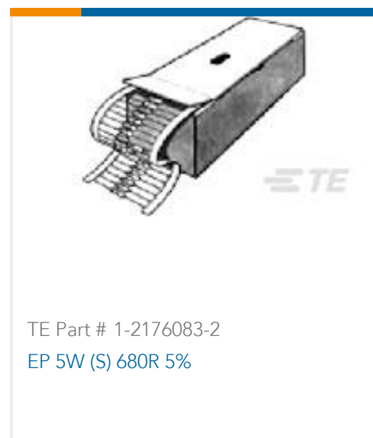
TE Part # 1-2176083-2 EP 5W (S) 680R 5%