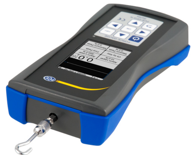
PCE-DFG N 5 Force gauge

For tensile force measurement and pressure force measurement up to 5 N / Very high accuracy / Sampling rate 1600 Hz / 6 different measuring tips / USB interface / Software / Calibration certificate