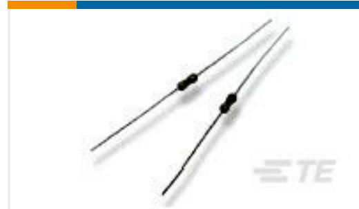
TE Part # 1623708-1 RGP0207CH 5% 100M