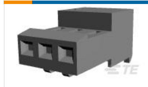
TE Part # 3-641537-3 03P MTA100 CONN ASSY LF