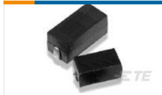
TE Part # 5-1879233-9 SMW5 27R 5%