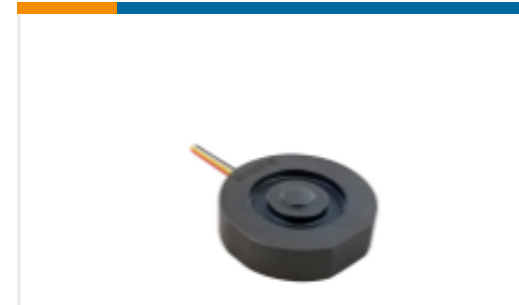
TE Part # 20009605-14 Compact Compression Load Cell