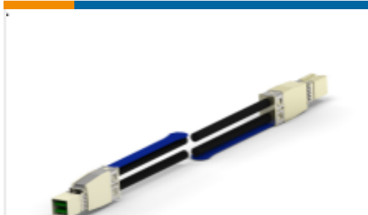
TE Part # 2337815-4 MINISAS HD TO MINISAS HD,30AWG, 3M