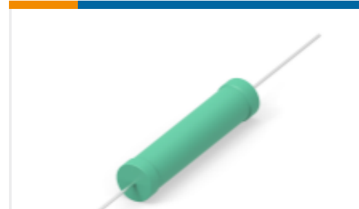
TE Part # 3-2176614-4 EP 10W (SS) 24R 5% BULK BOX