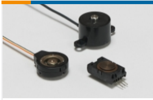
Force Sensor Elements(46)