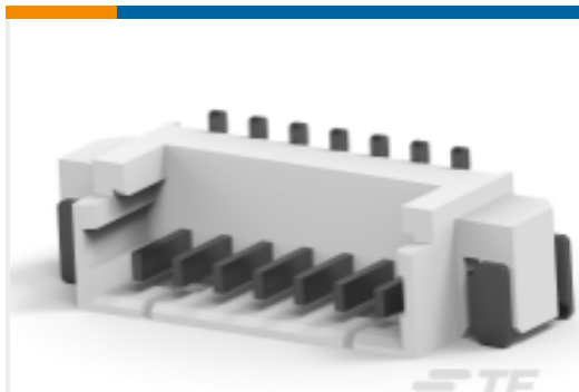
TE Part # 1734598-4 AMP HPI 1.25 mm Headers