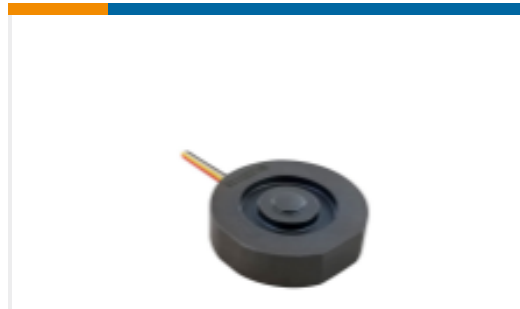
TE Part # 20009605-02 FX292X-040B-0050-L