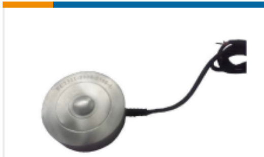
TE Part # FC2311-0000-0250-L COMPRESSION LOAD CELL - 100MV /0.5-4.5V