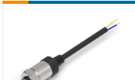
TE Part # 20014203-08 PRESS XDCR M323M-000004-070BG