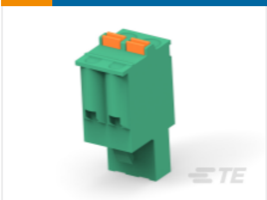
TE Part # 2350397-2 2 POS SPRING TB PLUG, PITCH 5.00