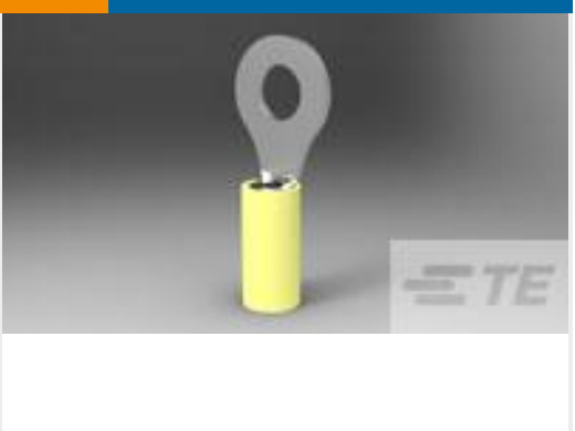
TE Part # 130205 PIDG RING