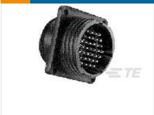
TE Part # 206151-1 23-37 RECEPT STD SEX