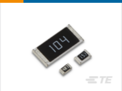
TE Part # 1-2176345-6 CRGCQ 1210 180R 1%