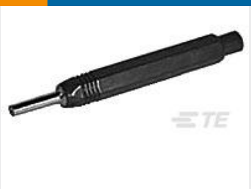
TE Part # 1102855-1 AWZG-HD.M-RSZ