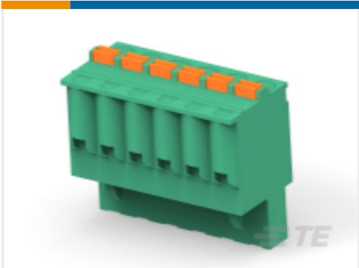
TE Part # 2350397-6 6 POS SPRING TB PLUG, PITCH 5.00