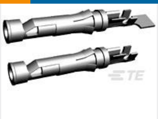
TE Part # 66601-1 III+ SKT,18-14,TIN-LEAD,LP