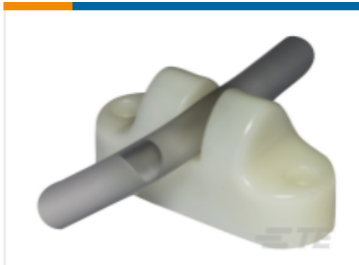
TE Part # 10217784-00 ABD,AD-101, COMPACT ASSY, 4MM