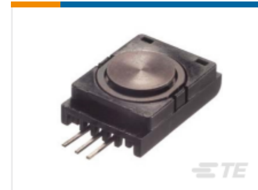
TE Part # 20015885-02 Compression Load Cell - 0.5-4.5V