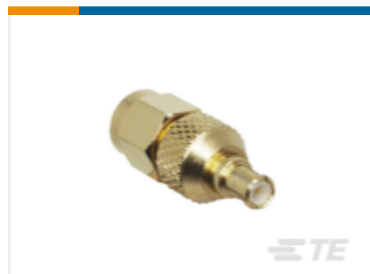
TE Part # ADP-SMAM-MCXM SMA Plug to MCX Plug