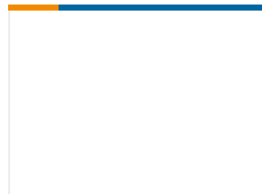
TE Part # SM3041-015-D-C-3-S MEDIUM PRESSURE I2C DIGITAL