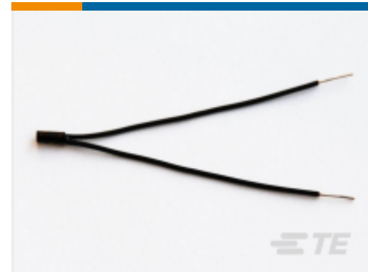
TE Part # GA10K3MBD1 MBD9-PROBE