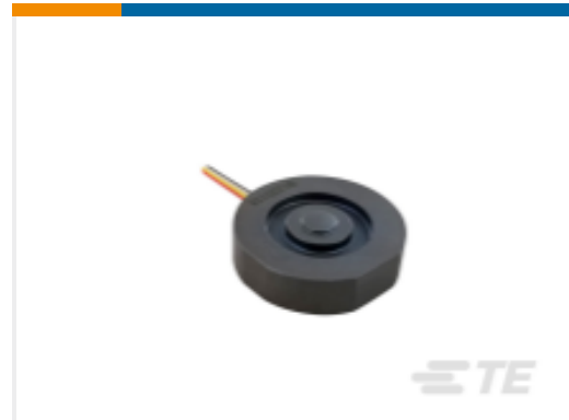
TE Part # 20009605-14 FX293X-100A-0050-L