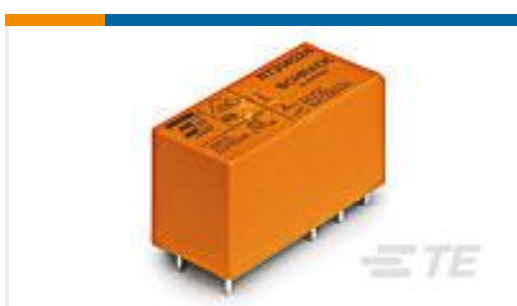
TE Part # 5-1393239-5 RT214024