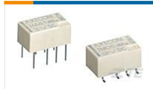
TE Part # 5-1462037-4 IM41GR=IM RELAY 100mW 3V BIS