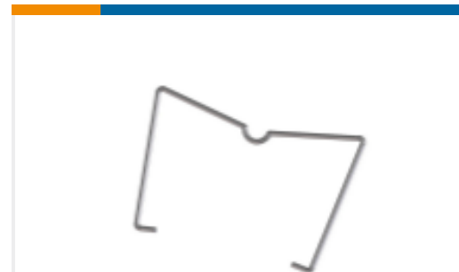
TE Part # 1419108-7 RT28516