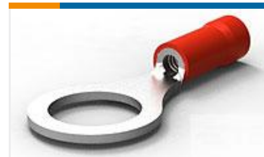
TE Part # 34151 PG R 22-16 COMM 22-18 MIL 5/16