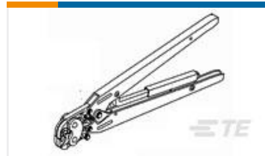
TE Part # 68026 DAHT TERMI-FOIL ASSY