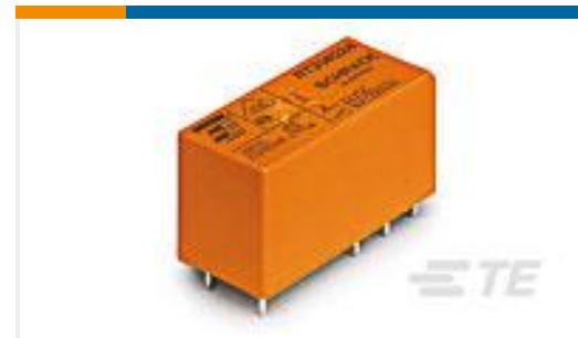
TE Part # 5-1393239-4 RT214012