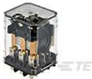
TE Part # 4-1393117-3 KUP-11D15-110=KU