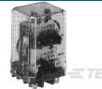
TE Part # 2-1393115-6 KUL-11A15S-120=KU