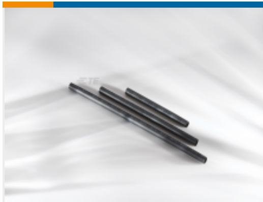
TE Part # 543633P064 SCT Heat Shrink Tubing