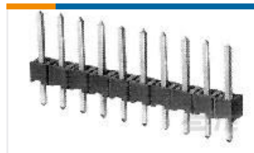
TE Part #2-826629-0 20P AMPMODU II PIN HDR