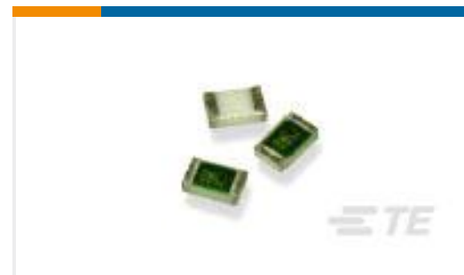
TE Part #8-1879208-4 CPF 0402 30K 0.1% 25PPM 1K RL