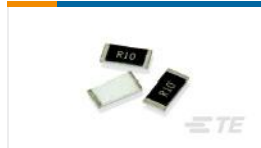
TE Part #3-2176056-5 RLP73K 2B R27 5% 5K RL