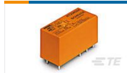
TE Part #3-1419108-8 RTD34024