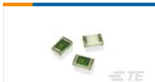
TE Part #1676153-3 RN 0805 10K 0.1% 10PPM 5KRL