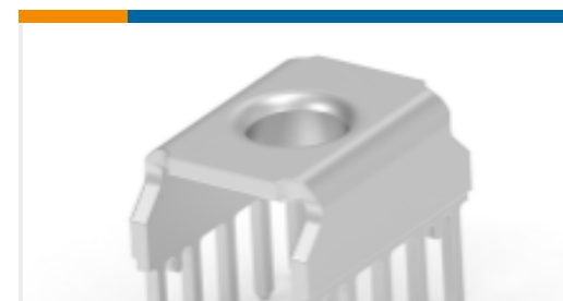
TE Part #214786-E EPSVA KS GDM4 TL 10 3,8 SN * STROMVERSOR