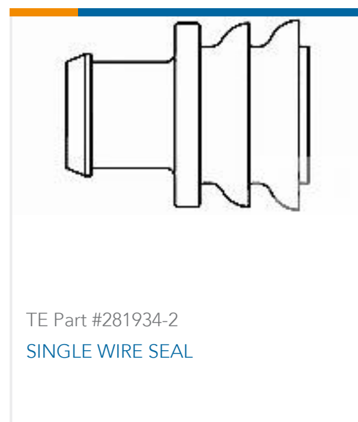
TE Part #281934-2 SINGLE WIRE SEAL