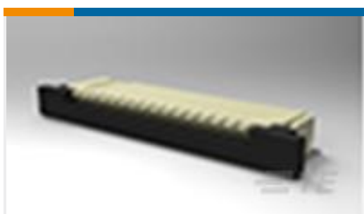
TE Part # 2-84953-2 1MM FPC HORZ.TOP CONT.ASSY 22P