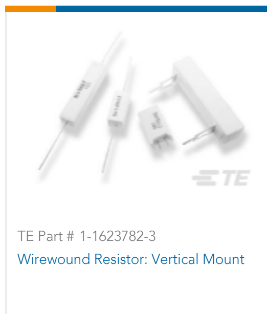
TE Part # 1-1623782-3 Wirewound Resistor: Vertical Mount