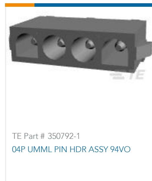
TE Part # 350792-1 04P UMML PIN HDR ASSY 94VO