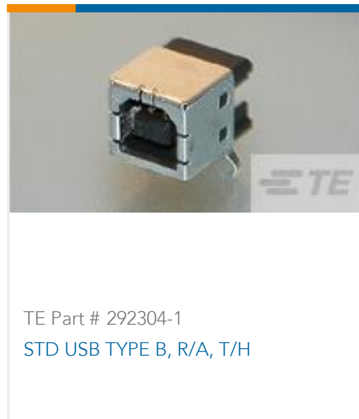
TE Part # 292304-1 STD USB TYPE B, R/A, T/H