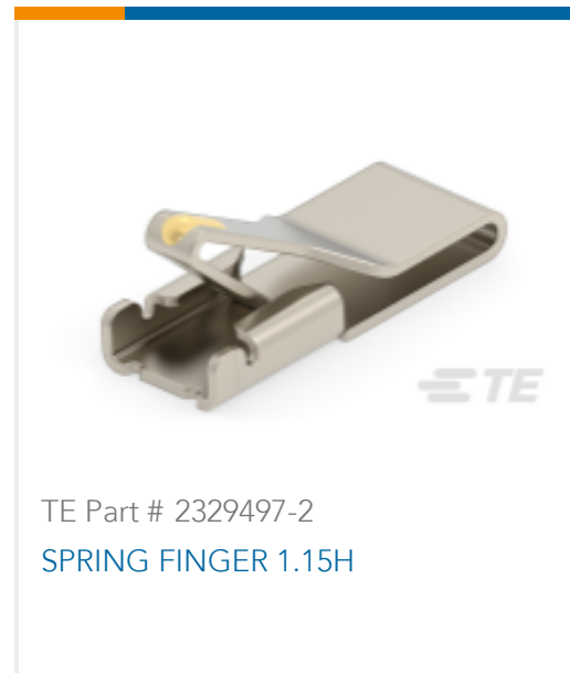
TE Part # 2329497-2 SPRING FINGER 1.15H