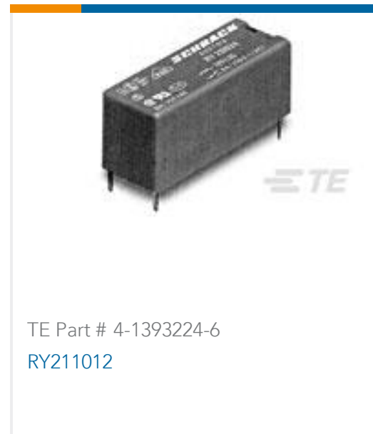
TE Part # 4-1393224-6 RY211012