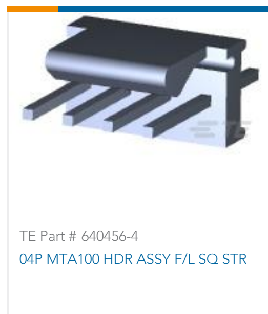
TE Part # 640456-4 04P MTA100 HDR ASSY F/L SQ STR