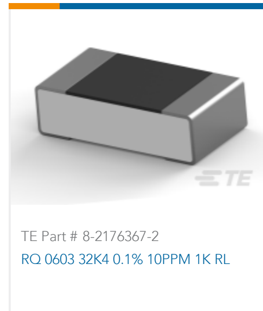
TE Part # 8-2176367-2 RQ 0603 32K4 0.1% 10PPM 1K RL