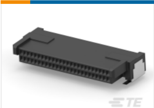
TE Part #294257-E DRCQ 0,80 50 F * SMD * 137 E009 094 GURT