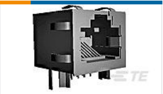
TE Part #2-1775365-5 MODULAR JACK, RJ45, SHIELD, SMT, 6u" Au