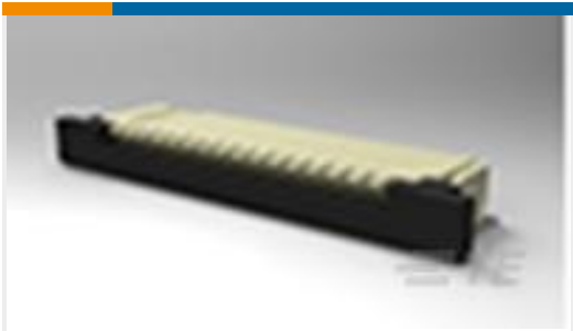
TE Part #1-84953-8 1MM FPC HORZ.TOP CONT.ASSY 18P