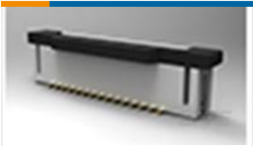
TE Part #2-1734248-0 1.0 FPC, ZIF V/T, SMT, 20P