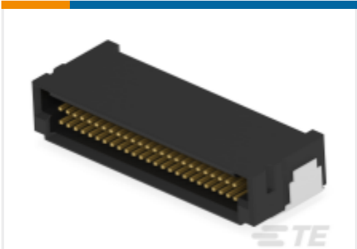
TE Part #294288-E DRCB 0,80 50 M SMD * 137 E009 196 GURT *