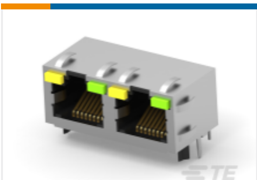
TE Part #3-6116353-2 INV MJ,1X2,PNL GRD,LED (G/Y)