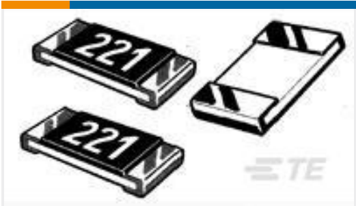
TE Part # 1-1622820-7 3520 1M 5%