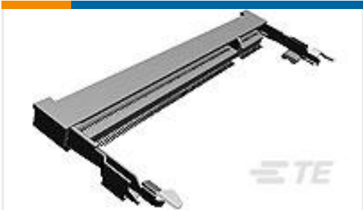
TE Part # 1473005-1 SEMI HARD TRAY DDR SOCKET 200P