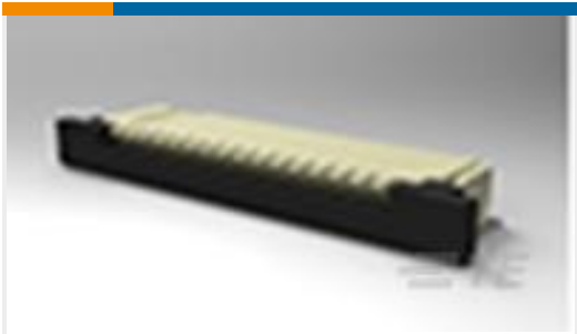
TE Part # 2-84953-7 1MM FPC HORZ.TOP CONT.ASSY 27P