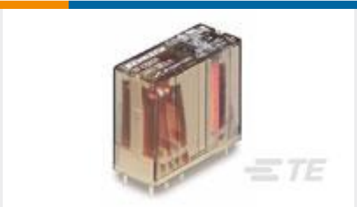
TE Part # 1393845-5 RP821024