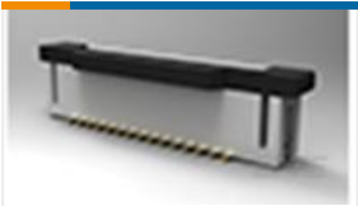
TE Part # 2-1734248-7 1.0 FPC, ZIF V/T, SMT, 27P