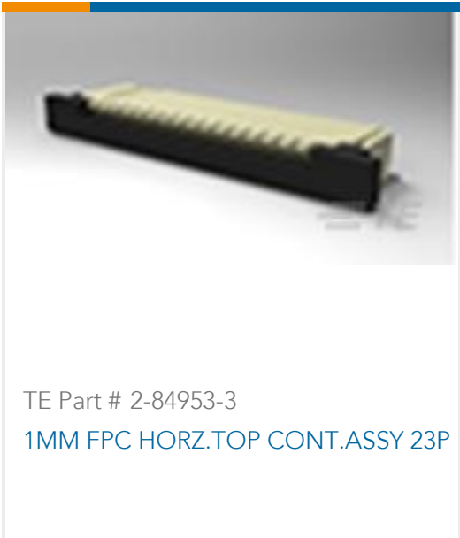
TE Part # 2-84953-3 1MM FPC HORZ.TOP CONT.ASSY 23P