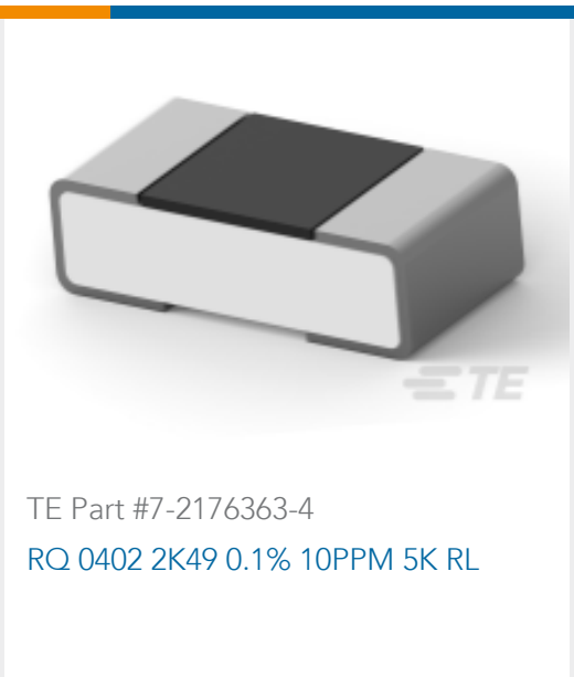
TE Part #7-2176363-4 RQ 0402 2K49 0.1% 10PPM 5K RL