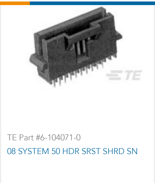
TE Part #6-104071-0 08 SYSTEM 50 HDR SRST SHRD SN