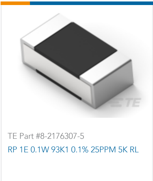
TE Part #8-2176307-5 RP 1E 0.1W 93K1 0.1% 25PPM 5K RL