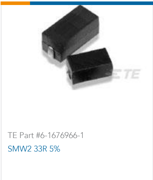
TE Part #6-1676966-1 SMW2 33R 5%