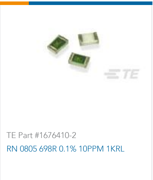
TE Part #1676410-2 RN 0805 698R 0.1% 10PPM 1KRL