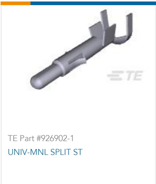
TE Part #926902-1 UNIV-MNL SPLIT ST