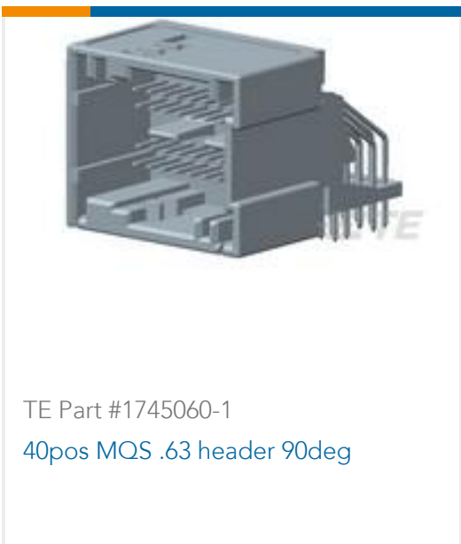
TE Part #1745060-1 40pos MQS .63 header 90deg