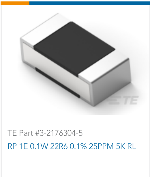
TE Part #3-2176304-5 RP 1E 0.1W 22R6 0.1% 25PPM 5K RL