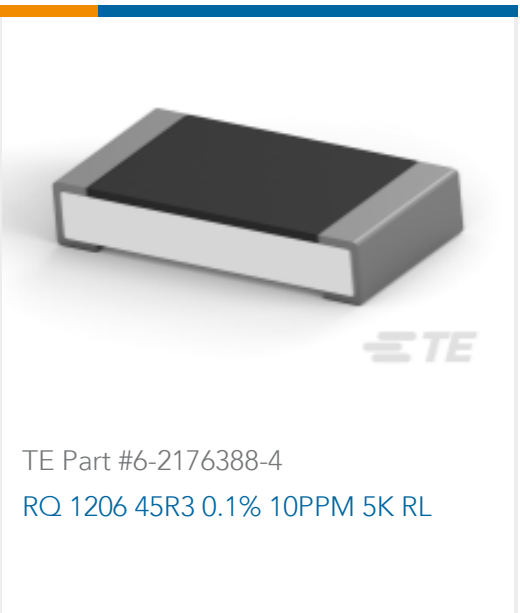
TE Part #6-2176388-4 RQ 1206 45R3 0.1% 10PPM 5K RL