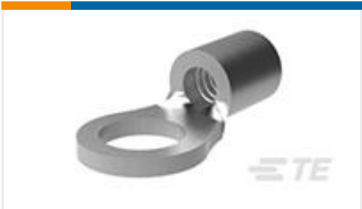
TE Part #31425 TERMINAL,BUDG R 26-22 2