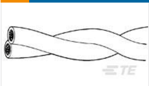
TE Part #083861-000 55PC0221-22-2/6CS2502