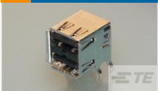
TE Part #5787617-1 RECP ASSY, R/A, STACKED, THRU-HOLE, USB,