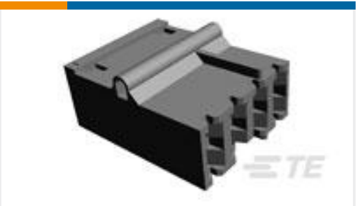
TE Part #928343-4 STD TIMER GEH 4P