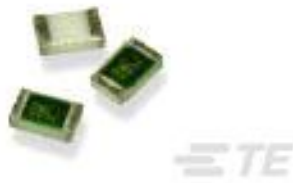
TE Part #1-1614884-7 CPF 0805 10R 0.1% 25PPM 1K RL