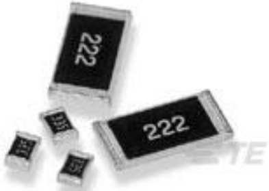
TE Part #9-1879377-8 CRGH0805 5% 10K 0.33W