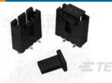
TE Part #5-1375583-1 02 MTE VERTICAL SMT HDR 30 AU