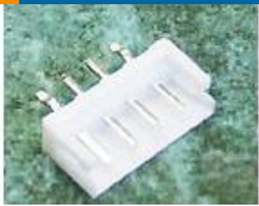
TE Part #1470224-3 HPI 2.5MM EMIX A'SSY V/T 3P