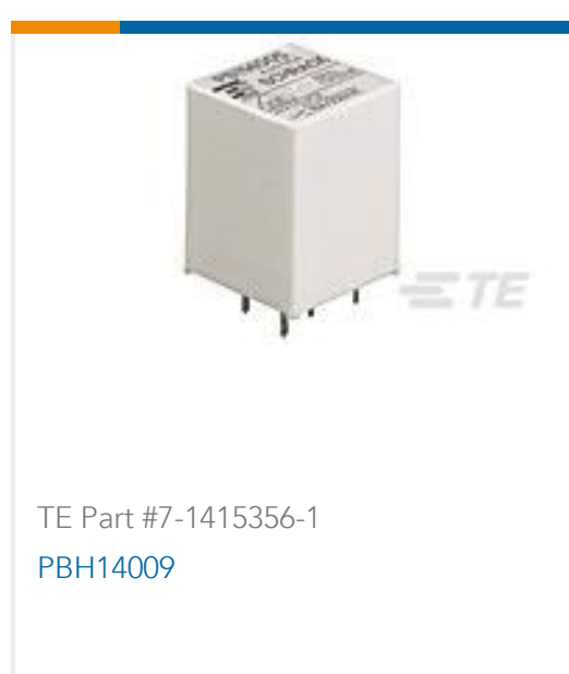
TE Part #7-1415356-1 PBH14009