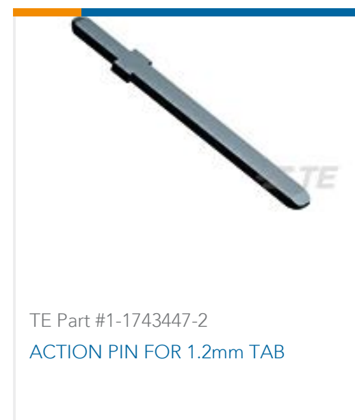
TE Part #1-1743447-2 ACTION PIN FOR 1.2mm TAB