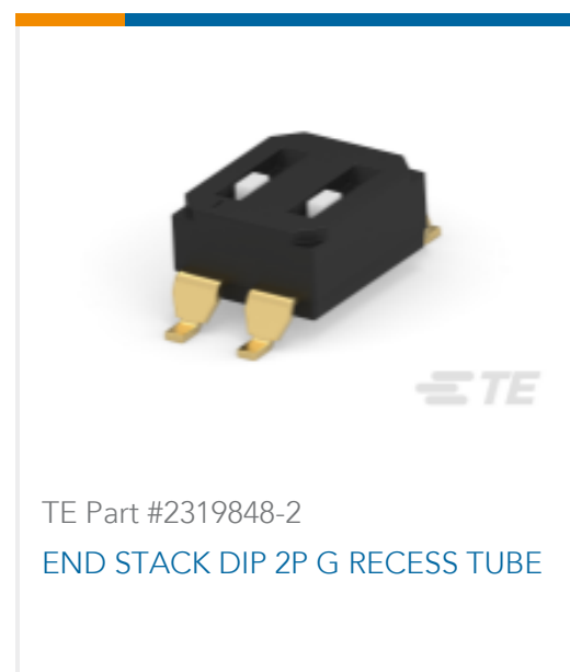
TE Part #2319848-2 END STACK DIP 2P G RECESS TUBE