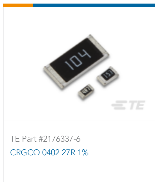
TE Part #2176337-6 CRGCQ 0402 27R 1%