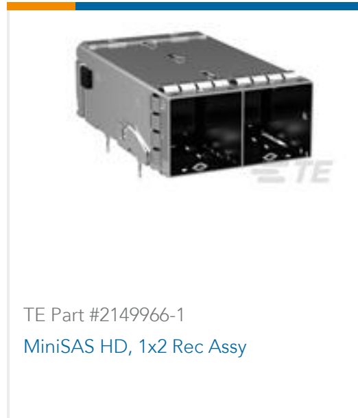
TE Part #2149966-1 MiniSAS HD, 1x2 Rec Assy