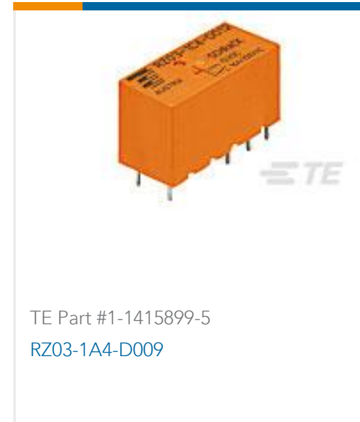
TE Part #1-1415899-5 RZ03-1A4-D009