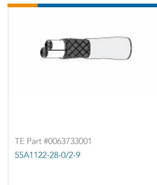
TE Part #0063733001 55A1122-28-0/2-9