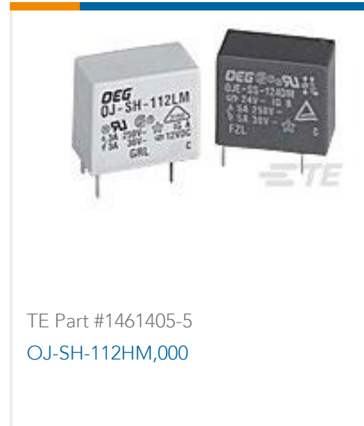
TE Part #1461405-5 OJ-SH-112HM,000