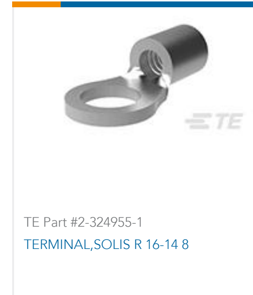
TE Part #2-324955-1 TERMINAL,SOLIS R 16-14 8