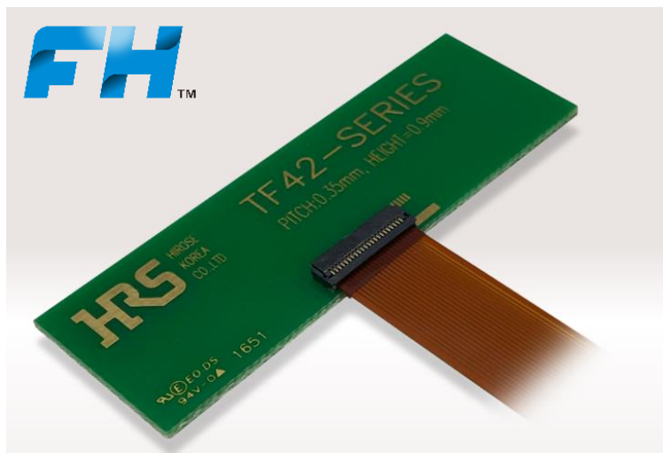
FH Flip-Lock Pioneer Hirose