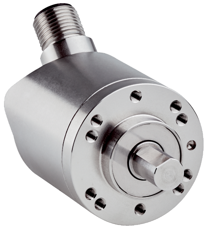
AHS/AHM36 Inox with face mount flange and M12 male connector