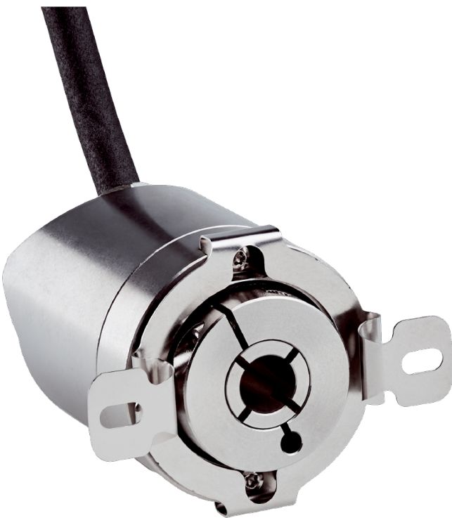
AHS/AHM36 Inox with blind hollow shaft and cable connection

The solution for applications with particularly harsh ambient conditions is AHS/AHM36 stainless steel Inox encoders. The housing, flange, shaft and stator coupling are made entirely of stainless steel (1.4305). Enclosure rating IP69K ensures additional impact protection which protects the shaft sealing ring installed in the encoder from the water jet of the shock blower.