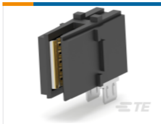
TE Part #2178531-4 Crown Clip Junior AG Plating Reflow