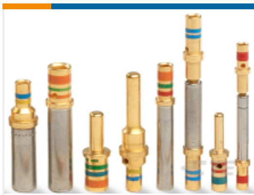
TE Part #ZPF0000000000000570 020-0511-20