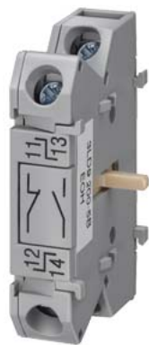
Auxiliary switch, 1 NO+1 NC, accessory for main and emergency switching-off 3LD2 switch front mounting and for molded case switch 3LD5 UL front mounting