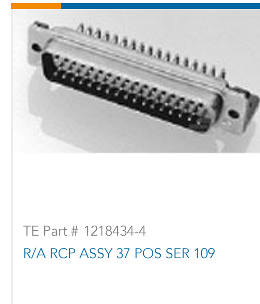
TE Part # 1218434-4 R/A RCP ASSY 37 POS SER 109