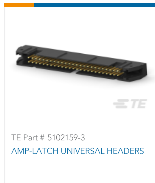
TE Part # 5102159-3 AMP-LATCH UNIVERSAL HEADERS