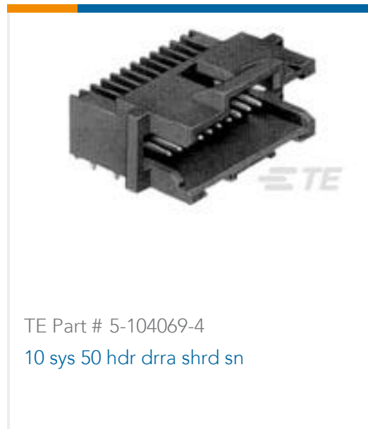
TE Part # 5-104069-4 10 sys 50 HDR DRRA SHRD SN