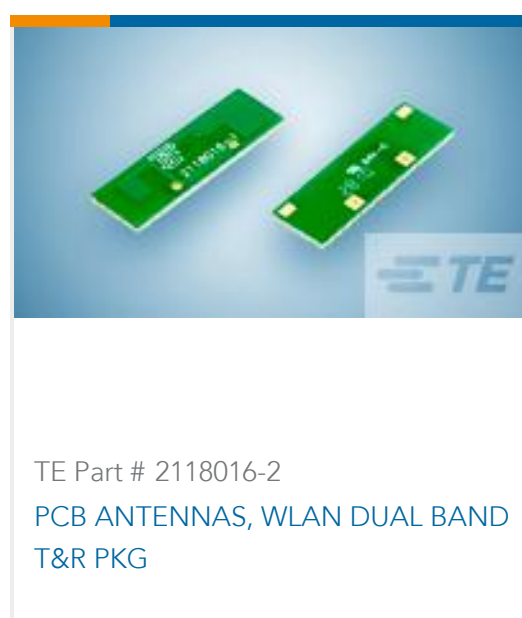
TE Part # 2118016-2 PCB ANTENNAS, WLAN DUAL BAND T&R PKG