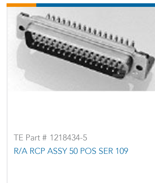
TE Part # 1218434-5 R/A RCP ASSY 50 POS SER 109