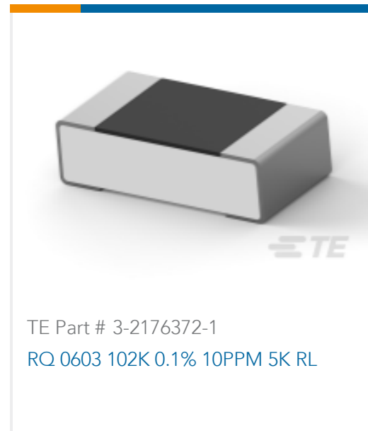
TE Part # 3-2176372-1 RQ 0603 102K 0.1% 10PPM 5K RL