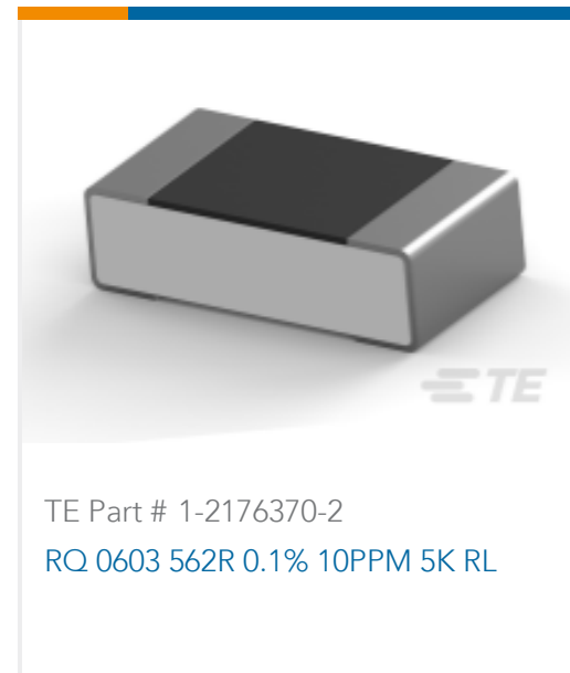
TE Part # 1-2176370-2 RQ 0603 562R 0.1% 10PPM 5K RL