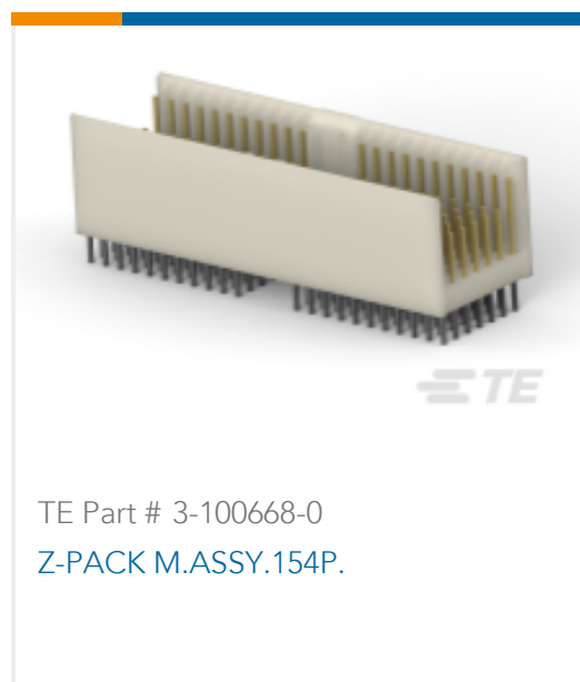
TE Part # 3-100668-0 Z-PACK M.ASSY.154P.