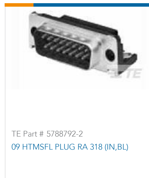
TE Part # 5788792-2 09 HTMSFL PLUG RA 318 (IN,BL)