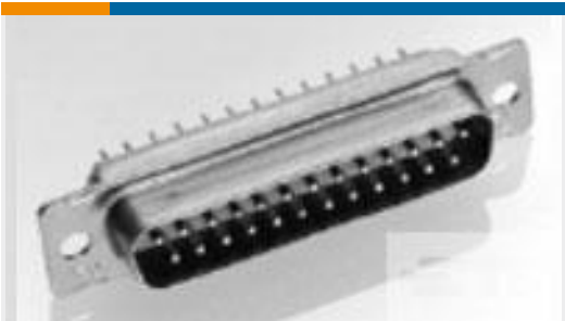
TE Part #204512-2 RECEPT ASSY,SZ 1,AMPLITE