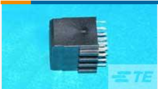
TE Part #1410270-2 MULTIGIG RT PWR .8" VRT RCP 4P PBF