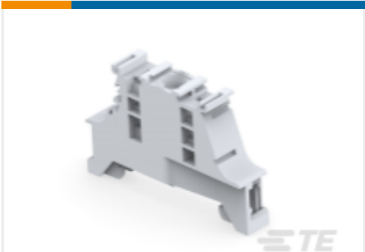
TE Part #1SNK900001R0000 BAM4