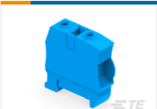
TE Part #1SNK516020R0000 ZS35-BL