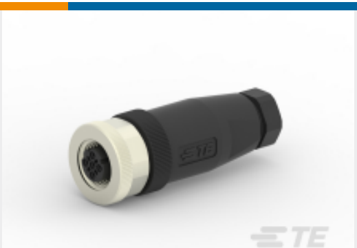
TE Part #T4110501041-000 M12,FEMALE,STRAIGHT,D CODE,4P, PG7,GOLD