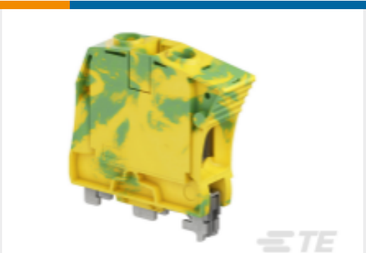
TE Part #1SNK516150R0000 ZS35-PE