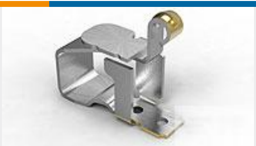
TE Part #1551575-5 Shield Finger, Loose Piece