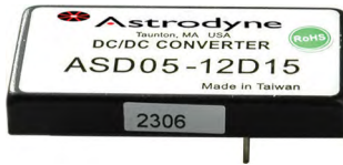
Unit measures 1"W x 2"L x 0.31"H