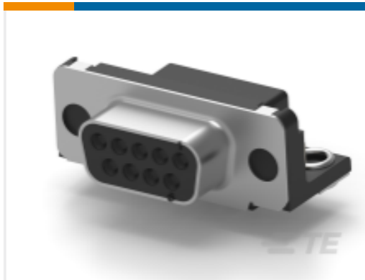
TE Part #5745988-4 D-Sub Receptacle Assembly: Right Angle, Shell Size 1, 2.74mm