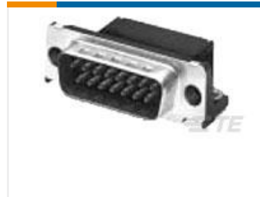
TE Part #5747833-4 15 MSFL PLUG RA 590 (IN,FM,BL)