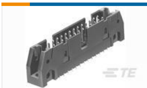
TE Part #2-1761679-9 IDC LOW PRO HDR 26P VERT BLUE