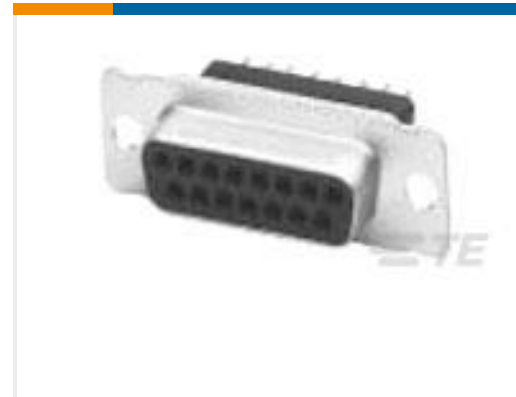
TE Part #5745886-2 25 RCPT SP/MS CNUT