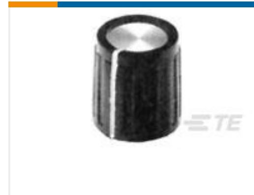
TE Part #5-1437624-9 PKG40B1/8=KNOB PLASTIC 1/8 LEX