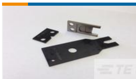
TE Part # 1-2217206-6 Blade, Slug