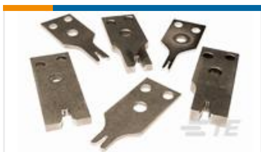
TE Part # 3-1633730-5 CRIMPER, WIRE F .039F