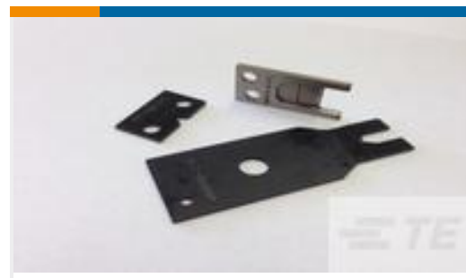
TE Part # 2-691157-6 BLADE, SHEAR