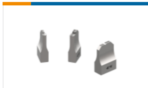
ANVIL REPRESENTATION ONLY 3D TE Part # 2-1803055-1 ANVIL, COMBINATION