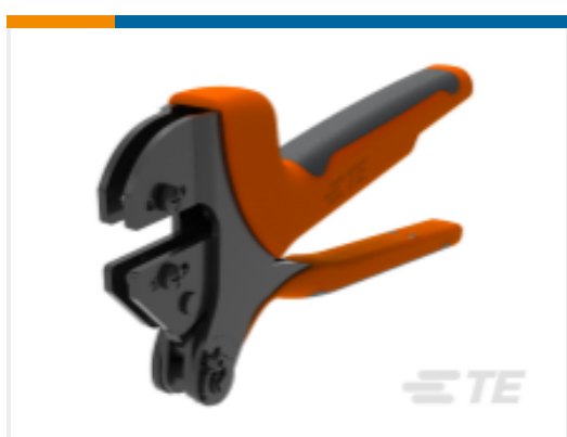
TE Part # 2362810-1 SDE CRIMP HAND TOOL FRAME W /O DIES