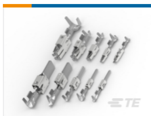
TE Part # CAT-T4827-T273 TIMER, RECEPTACLE AND TAB