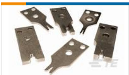
TE Part # 6-1633961-4 CRIMPER, INSULATION F PREMIUM