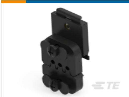
TE Part # 2391435-2 SDE F PIN/SOCKET 16-18 DIE SET