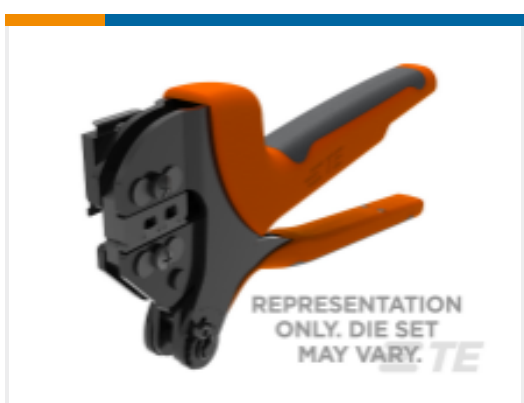
TE Part # 2395308-1 SDE F FLAT CONTACT 2.8 0.50-1.00 mm2 ASSY