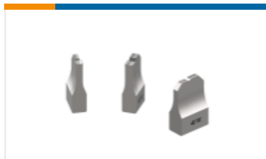
ANVIL REPRESENTATION ONLY 3D TE Part # 5-1803001-5 ANVIL, COMBINATION, END FEED