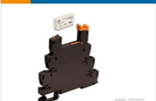
TE Part # 2-1416100-0 ST3FLC4