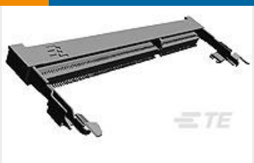
TE Part # 2-2013298-1 EMB OSS TAPE DDR3 204P 8H RVS