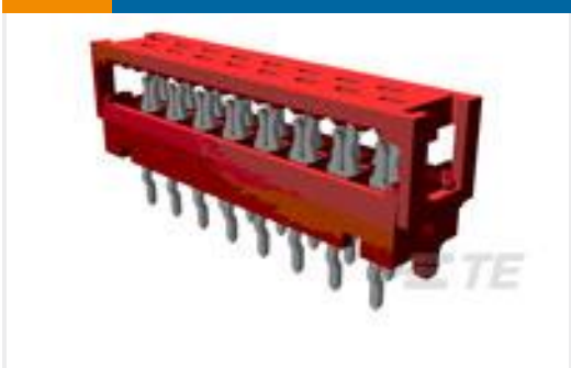
TE Part # 8-215570-0 MICRO-MATCH PBC.10P