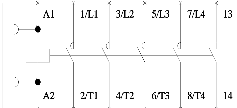
LEN00B004 Wiring Diagram