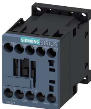
Contactor relay, 3 NO + 1 NC, 48 V DC, Size S00, screw terminal